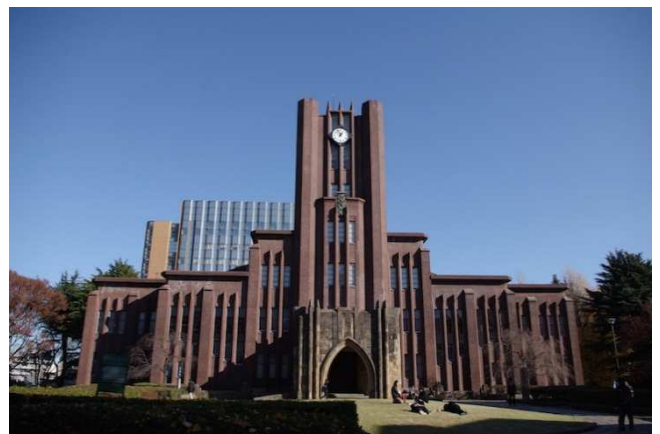
A clock tower of the Univ. of Tokyo

Questions can be sent to ciu2015@csis.u-tokyo.ac.jp