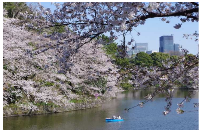
Cherry blossom of Chidori-ga-fuchi