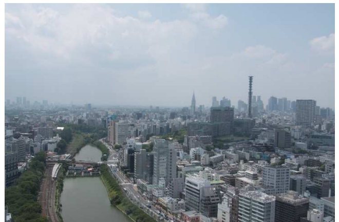
A view from Iidabashi