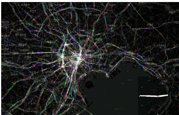
Visualization of people's movement before the big earthquake on March 11, 2011 (Sekimoto, 2013)

Work in progress - to present ongoing work. Review of the abstract. If accepted, you are invited to give an oral presentation at the symposium and an extended abstract or full paper (your choice) will be published in the online proceedings of the symposium. Work in progress abstracts (up to 600 words) must be written in English and submitted through the EasyChair website by 15th December.