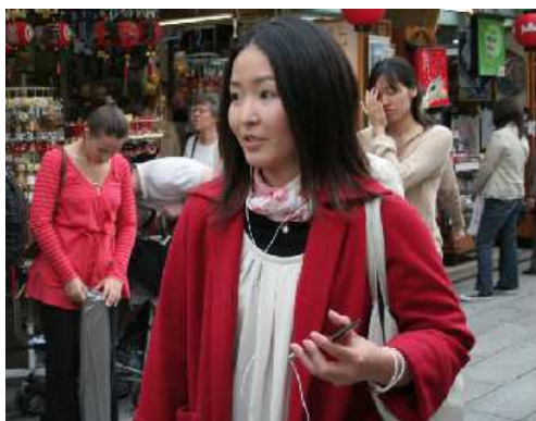
A tourist's using a place synchronized audio tour app at the Sensouji Temple Street of Asakusa

Poster presentation - Review of the abstract. If accepted, you are invited to give a poster presentation at the symposium and an extended abstract will be published in the online proceedings of the symposium. Abstracts (up to 300 words) must be written in English and submitted through the EasyChair website by 15th December.